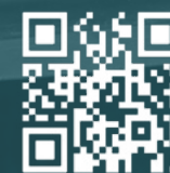
Scan the QR Code for more information

Be sure to read about each semifinalist's business concept in the 2024 Annual Report!