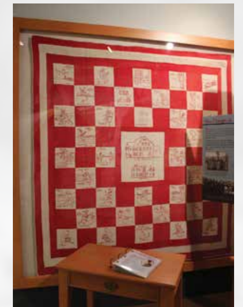
Jesse Lee Home Quilt. 2007.001.001