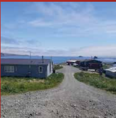
LEARN MORE ABOUT AXAM CORPORATION ON PAGE 7