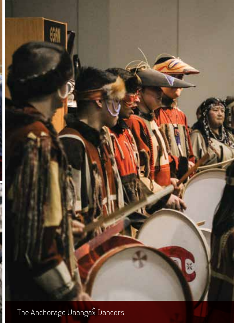
The Anchorage Unanga Dancers