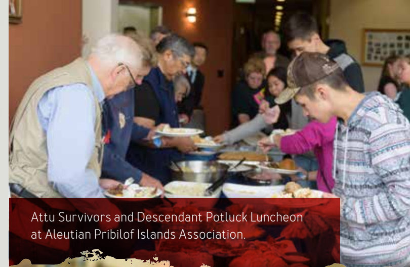
Attu Survivors and Descendant Potluck Luncheon at Aleutian Pribilof Islands Association.