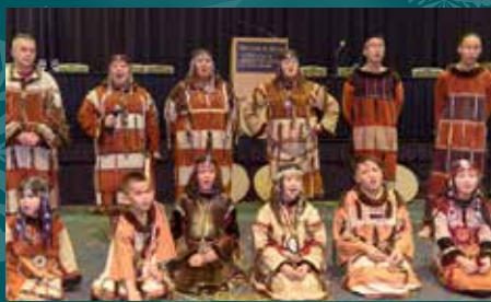
ANNUAL MEETING EVENTS This year the Atka Dancers performed at Culture night and the Annual Meeting. Check out pictures on pages 4-5.