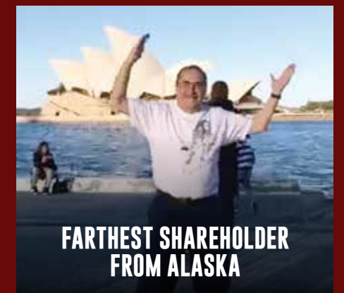
FARTHEST SHAREHOLDER FROM ALASKA