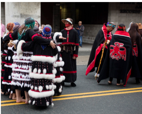
A few Aleut Corporation shareholders participated in Celebration 2016 in Juneau, Alaska in early June. Above, the Kodiak Alutiiq Dancers prepare for the Grand Exit.