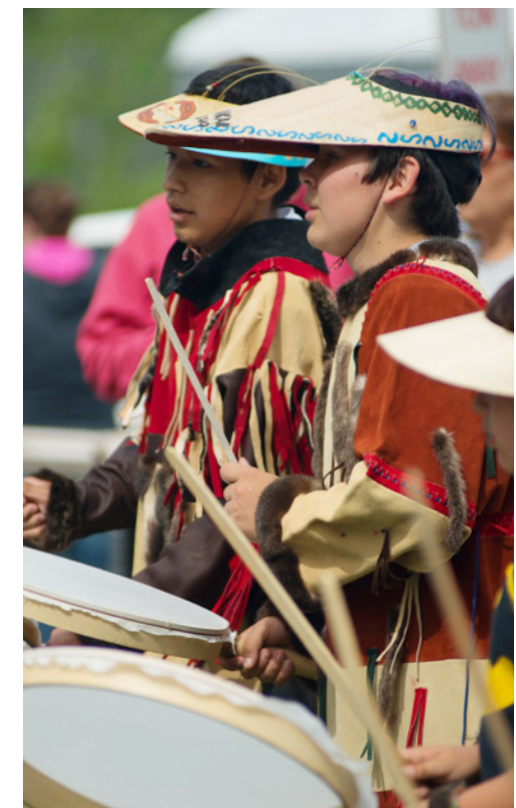
Urban Unangax Youth Dancers perform at the 2016 Annual Picnic

The Aleut Foundation provides an Advanced College Credit Scholarship for those students taking college courses while in high school. We have had two students who, when they graduated high school, also earned their Associate's degree. Call the Foundation for more information.