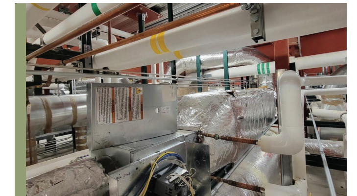
HVAC Installation work at JBER

Aleut Patrick Mechanical is headquartered in Fairbanks, Alaska and primarily installs complex mechanical or utility systems for commercial customers in the Fairbanks North Star Borough. APMH's focus has been expanding their customer base beyond Fairbanks and recently has been working on renovation projects for the barracks on Joint Base Elmendorf Richardson in Anchorage, AK. Fort Wainwright army base, Holland America along with University of Alaska Fairbanks, and Fairbanks Memorial Hospital, are some of APMH's largest customers in the Fairbanks area.