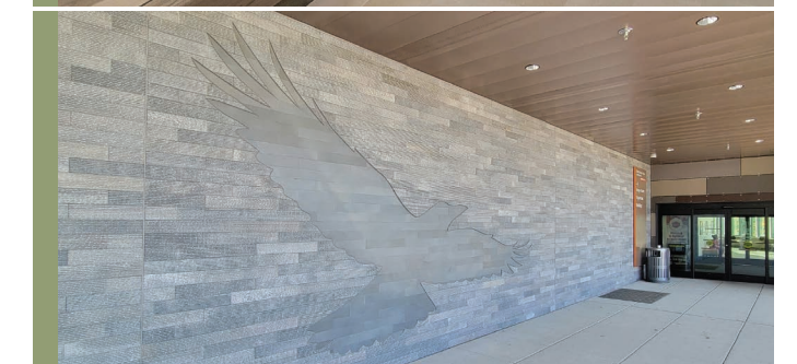
Renovation Project at the Chief Andrew Isaac Health Center (Fairbanks, AK)